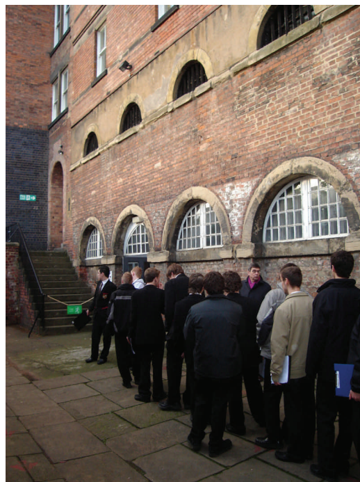
Outside the Galleries of Justice