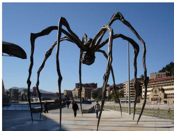
El Museo Guggenheim

We caught our flight back and travelled by coach before arriving back in Sleaford very early on the Wednesday morning. Everyone really enjoyed the trip and I think we would all do it again!