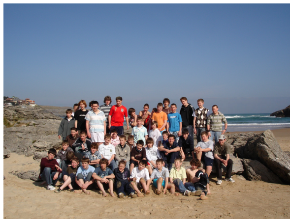
El grupo en la playa