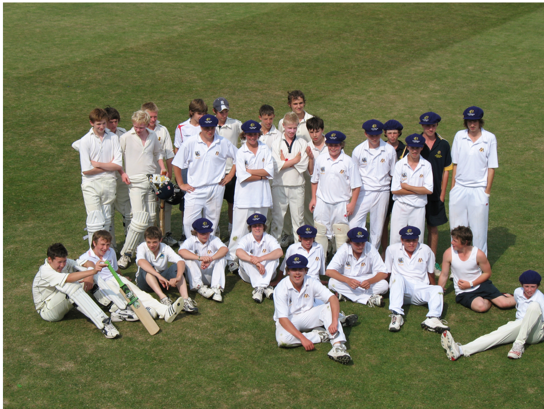
Carre's and Mornington cricket teams - 4 July 2006