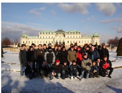
Whole group in grounds of Art Museum