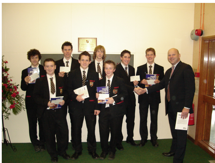
Our sportsmen receiving their Bursaries from the Headteacher

Congratulations to them and best wishes for their future sporting careers, look out for them in 2012!